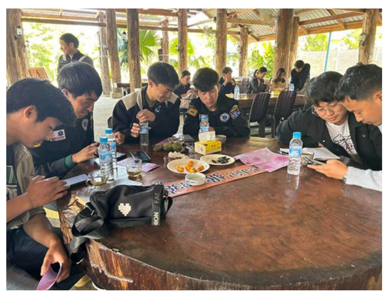
First responders from the Lisu Youth Community Rescue Team using MyLibrary in Putao to build their first aid skills.

We pack our digital MyLibraries with medical and health resources specifically for locations where there is limited or no access to medical professionals, along with guides covering topics such as sanitation, helping those with disabilities, and care for pregnancy and birth.