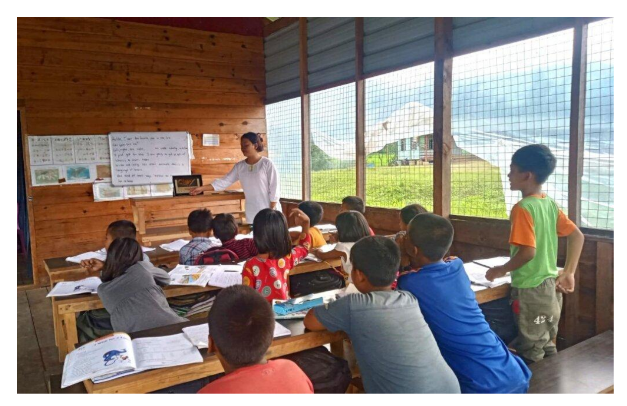
English language lesson at the new school in Cikha

Through Raise a Hand , we have set up learning hubs at two of these community-run schools. Each hub is powered by an off-grid, self-contained eTekkatho MyLibrary, offering thousands of digital educational resources for learners of all ages.