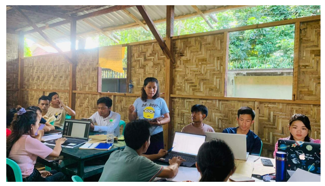
Teacher trainina at NSi

The Tekkatho Foundation supports this programme by providing access to the eTekkatho MyLibrary and leading weekly teacher training sessions. This work forms part of our broader commitment to strengthening non-government adult education in Myanmar's border regions.