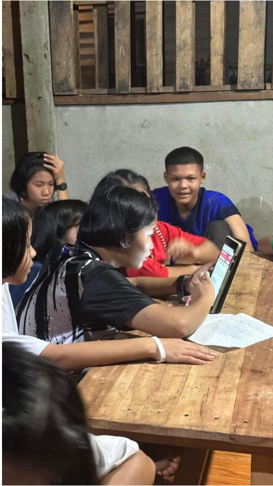
School children explore MyLibrary at Maw Paw Khoet.