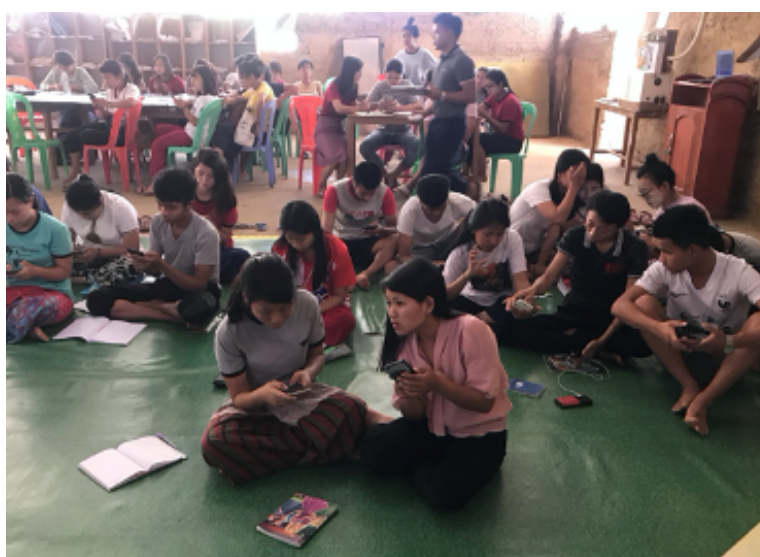
MyLibrary training event at Pinnya Tagar Academy, April 2019

Students became self-reliant learners, and they are now in control of their own destined learning goals toward greater vision in their lives. Both students and teachers are now working together to quench the thirst for wisdom; both have been learners, and the relationship of both teachers and students are now more meaningful and reciprocal."