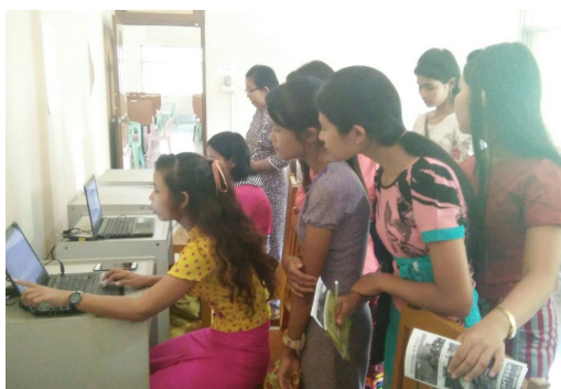
Group of students using eTekkatho at Dawei University July 2019