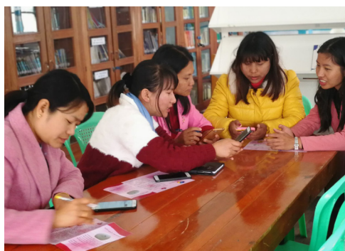
Learning with eTekkatho at Hakha Millennium Centre June 2019