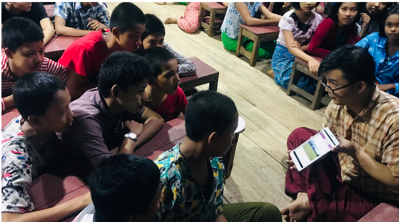
MyLibrary training event at Yay Kyaw Toe high school