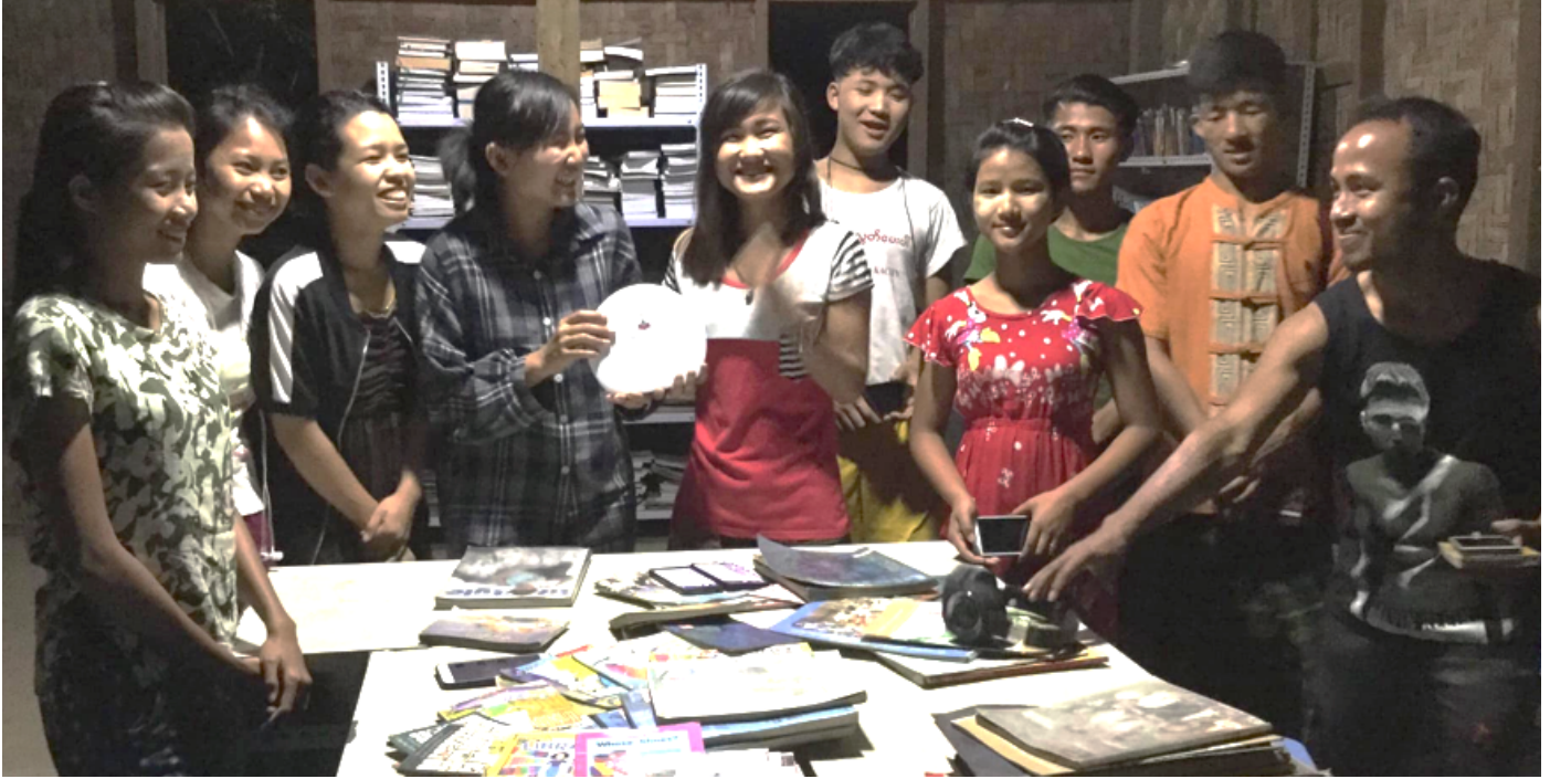
Students learning to use eTekkatho at Maina IDP Camp